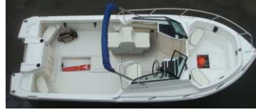
#4 Pedestal Seat & Sleeper Seat