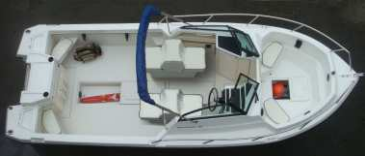
#6 Sleeper Seat & Sleeper Seat