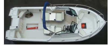
#9 Sleeper Seat & Dinette