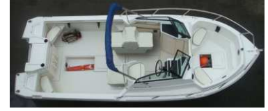
#5 Companion Storage Seat & Sleeper Seat