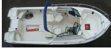
#3 Companion Storage Seat & Companion Storage Seat