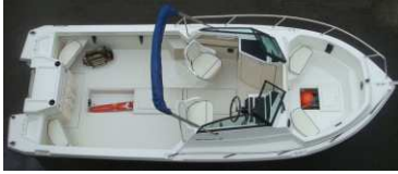
#1 Pedestal Seat & Pedestal Seat