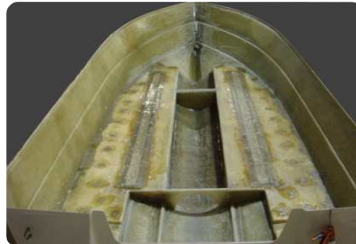
Fiberglass Stringer under floor Foam injected holes were sealed by Fiberglass