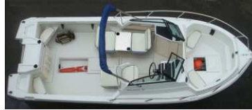
#8 Companion Storage Seat & Dinette