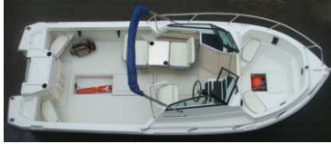
#7 Pedestal Seat & Dinette